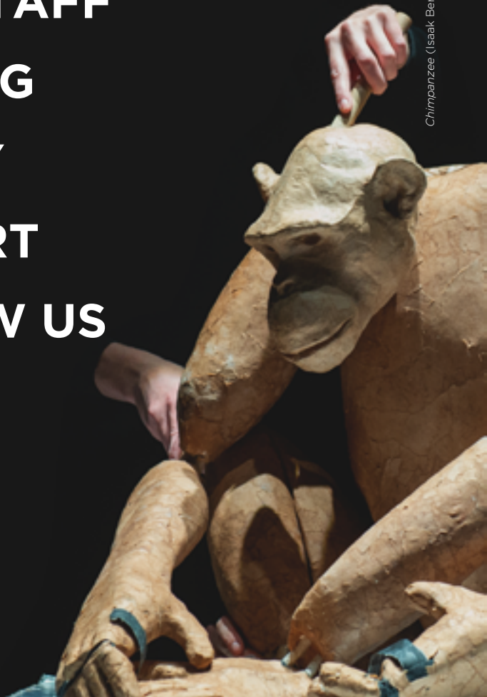
Chimpanzee