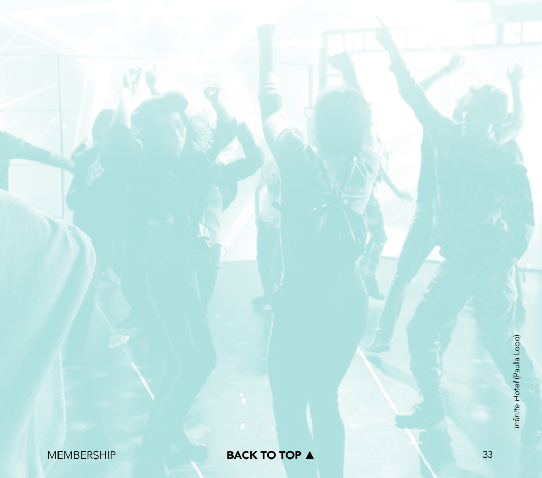
Infinite Hotel (Paula Lobo)

Contact Auburn Hicks: 212.647.0202 x 327 auburn@here.org OR visit here.org/support