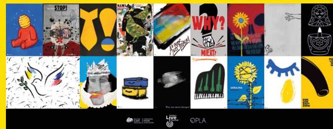
Poster Exhibition Reflecting On Ukraine

Our “TODAY” Poster project, which responds to current events in Hungary and the world, this time focuses on the unfortunate Russian-Ukrainian war conflict. The reactions, expressed in the visual language of the poster, reflect the individual, subjective opinions of the artists.